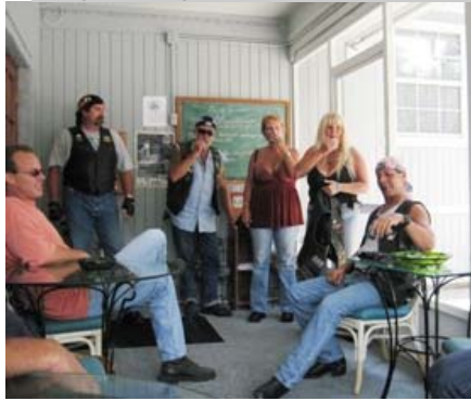
Smoke Break at Boondocks